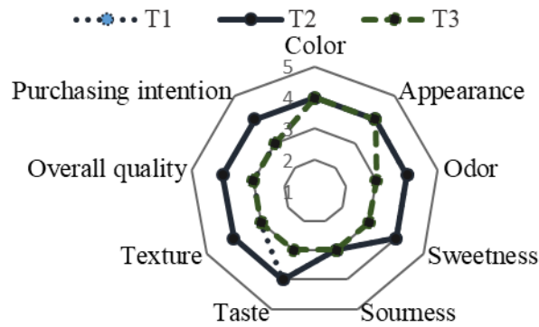
Figure 1: Mean scores obtained for sensory attributes of oat incorporated drinking yogurt (T1 – 0.25 g Oat powder per 100 ml of milk, T2 – 0.5 g Oat powder per 100 ml of milk, and T3- 1.0 g Oat powder per 100 ml of milk)

The purpose of the second sensory evaluation was to compare the oat drinking yogurt selected from the first sensory evaluation to commercial yogurt. Color, appearance, taste, texture, overall quality, purchasing intention, odor, sweetness, and sourness did not differ significantly between the selected oat drinking yogurt and commercial yogurt (Figure 2).